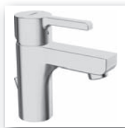
HANSAFORM one-hole single-lever basin mixer, DN 15 4909 2203 chrome pop-up waste (metal), connection with flexible hoses G 3/8 projection: 99 mm