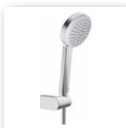
HANSAVIVA-Set for bath mixers 4417 0110 chrome HANSAVIVA handshower 1-spray, 100 mm, shower hose 1250 mm