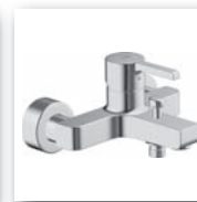
HANSAFORM single-lever bath mixer, DN 15 (G 1/2) 4974 2103 chrome projection: 159 mm