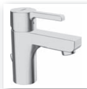
HANSAFORM one-hole single-lever basin mixer, DN 15 4909 2103 chrome pop-up waste (metal), connection using copper pipes projection: 99 mm