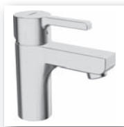
HANSAFORM one-hole single-lever basin mixer, DN 15 4905 2203 chrome without pop-up waste, connection with flexible hoses G 3/8 projection: 99 mm