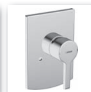
HANSAFORM trim kit single-lever shower mixer, DN 15 4995 7003 chrome plus 5000 0100 concealed base unit