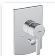
HANSAFORM trim kit single-lever bath mixer, DN 15 4994 7003 chrome plus 5000 0100 concealed base unit