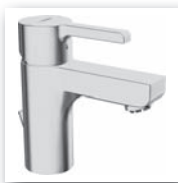
HANSAFORM one-hole single-lever basin mixer, DN 15 for open hot water heaters 4913 1103 chrome # pop-up waste (metal), connection using copper pipes projection: 99 mm