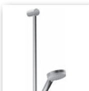
HANSAVIVA wall bar set 900 mm 4415 0130 chrome HANSAVIVA handshower 3-spray, 100 mm- shower hose 1750 mm- length can be shortened