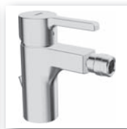
HANSAFORM one-hole single-lever basin mixer, DN 15 for bidet 4906 3203 chrome pop-up waste (metal), connection using copper pipes projection: 106 mm