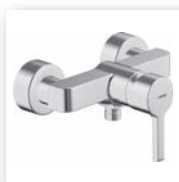
HANSAFORM single-lever shower mixer, DN 15 (G 1/2) 4967 0103 chrome