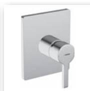
HANSAVAROX function unit with trim kit for HANSAFORM single-lever shower mixer 4993 9003 chrome plus 4000 0000 *concealed base unit