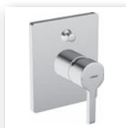
HANSAVAROX function with unit with trim kit for HANSAFORM single-lever bath mixer 4992 9003 chrome plus 4000 0000 *concealed base unit with vacuum breaker 4992 3003 chrome plus 4000 0000 *concealed base unit